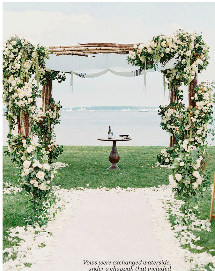
Vows were exchanged waterside, under a chuppah that included birch branches, eucalyptus, and 'White Lady' spray roses, topped by the Cohen family tallit.