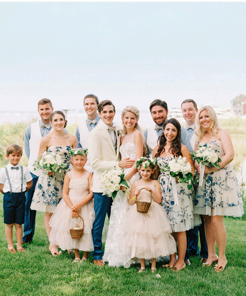
The bride, in a custom Mira Zwillinger gown, tapped her fashion know-how to outfit the family-only bridal party. All the men wore Alton Lane; the bridesmaids, Marchesa Notte.